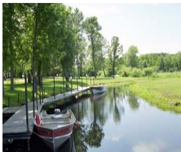
Protected harbor for your boats